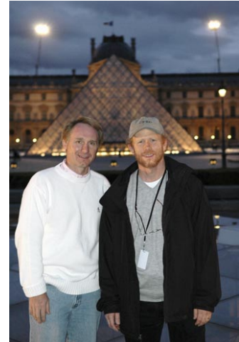
Da Vinci author Dan Brown and director Ron Howard in front of the Louvre Museum.

http://www.boxofficemojo.com/movies/?page=media&img=7516&id=davincicode.htm