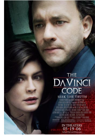
“The Da Vinci Code” poster http://www.boxofficemojo.com/movies/?page=media&img=7484&id=davincicode.htm